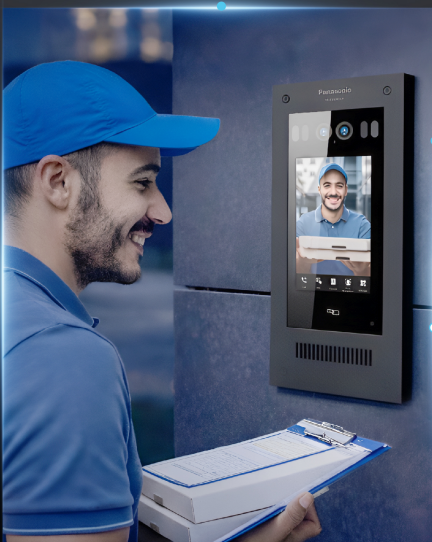
Lobby Display Station