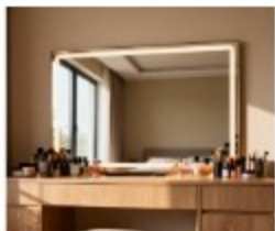
Dressign Table & Mirror